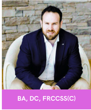
BA, DC, FRCCSS(C)

All instructors are also Complete Concussions Academy Faculty Members available for ongoing support!